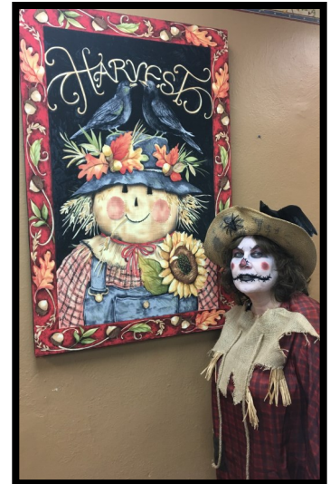
Above- Who wore it best?