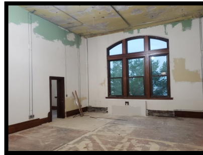
The room added in the back corner (left) of the Circuit Clerk's Office has been removed. This is the main office space - the office area closest to the elevator.