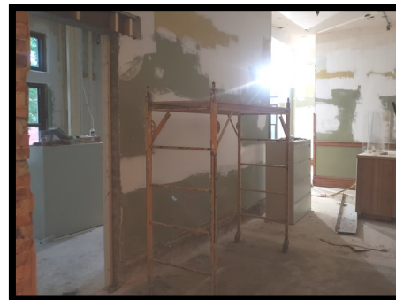
Another door has been added to the Assessor's Office (see left side - picture was taken from the main office entrance).