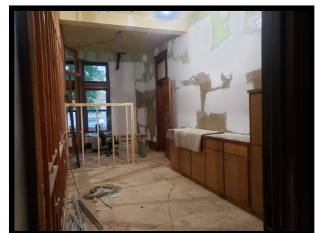
The Treasurer's Office will now have an office area. (see the half wall -back left)