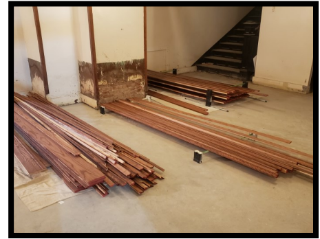
Old and new woodwork is being stained and top coated.