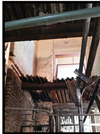
Before and after pics of the second floor men's bathroom. The floor has been replaced and looks much safer!