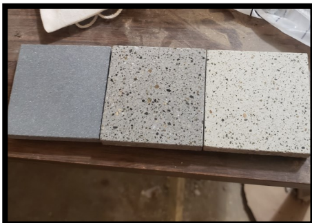
Areas with original hard wood flooring (mainly offices and courtrooms) will be restored. All other areas will be stained concrete with one of the three options shown left.