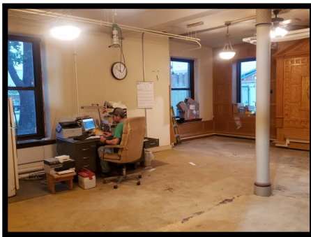
The maintenance shop has been temporary moved to the 1st floor west courtroom.