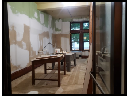
The Mapping Office is ready for paint.