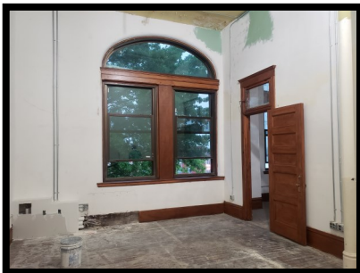
Presiding Judge's Administrative Office Area (3rd Floor). The wood work was still drying when this picture was taken.