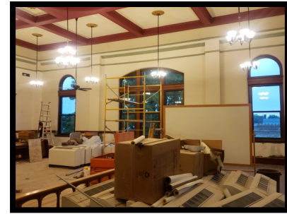
The woodwork in the 3rd floor courtroom is currently being refinished. The carpet has been removed and the hard wood floors will be restored.