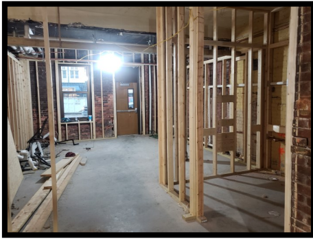
Former Veterans Office (1st Floor)

Part of the Veterans Office will be converted into a handicap accessible unisex bathroom (framed in area pictured front right).