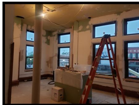
The Reorder's Office (as well as other offices) will have drop ceilings installed but the top windows will remain visible.