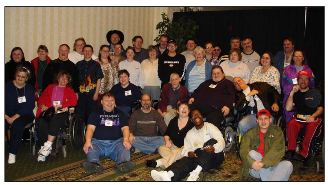
Members of People First of Missouri's Statewide Steering Committee represent a diversity of cultures situations, needs and available supports. The committee meets quarterly to learn about best practices.

Sometimes, even when a parent or loved one would otherwise choose an alternative to guardianship for support and protection of an individual, there are circumstances where in order to protect a person's rights, they will choose a guardianship option to make sure that continuing care is provided for that individual by having the legal authority that is being required by a particular service provider or system. However, it is important to remember that guardianships can be very difficult to modify or terminate.