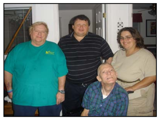
Statewide Officers of People First of Missouri use alternatives to guardianship for support, including, but not limited to support from their church, family, and friends in the community.

If an individual only needs assistance with financial issues, then you should consider conservatorship, which gives someone control only over the financial affairs of an individual. For more information on conservatorship, visit The Missouri Bar website at <a href="https://www.mobar.org">www.mobar.org</a>.