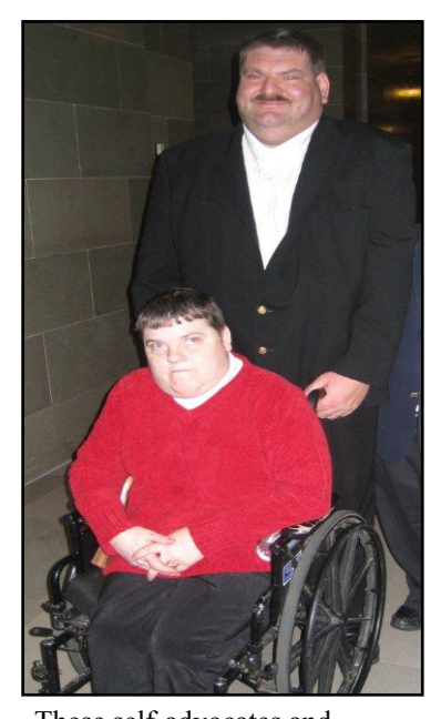
These self-advocates and members of People First of Missouri (above) own their own home, as well as hire, fire, train, and determine their own services and supports.

Remember, guardianship involves the loss of fundamental rights, so it should be considered only when a person cannot make informed decisions on their own or when accommodated or supported in their decision making.