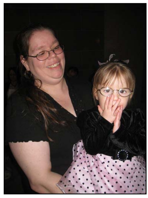
A self-advocate and Statewide Officer of People First of Missouri, who is married with children, enjoys a little play time with her daughter