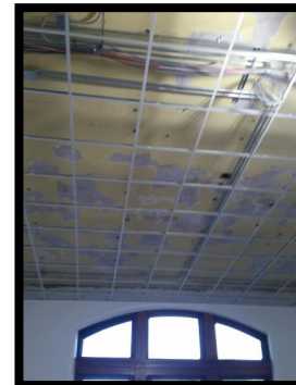
Gridwork for ceiling tiles has been installed.