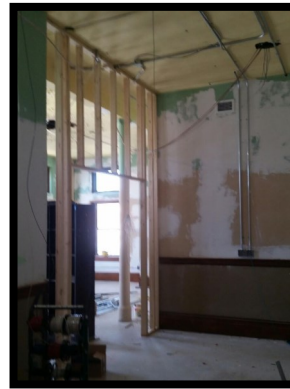
There will now be a wall in the Commission Office separating the Commissioners and the reception area.