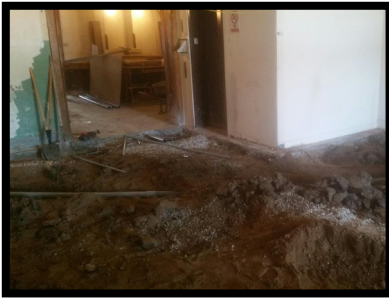
Concrete on the 1st floor (west side) is being removed and replaced. This should be the last phase of the interior concrete replacement work.