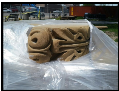
New ornamental sandstone creatures were created and will be perched back on the courthouse exterior replacing the old weathered ones.