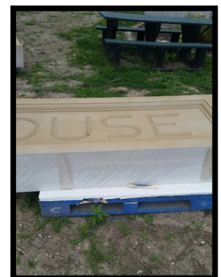
The sandstone "COURTHOUSE" placard was recreated is now ready to be reinstalled above the south entrance.