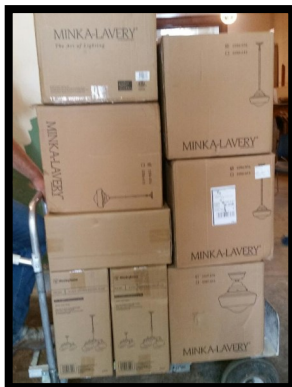
The new light fixtures were delivered.