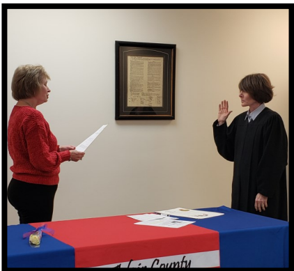
Associate Circuit Court Judge Kristy Swaim - 6th Term